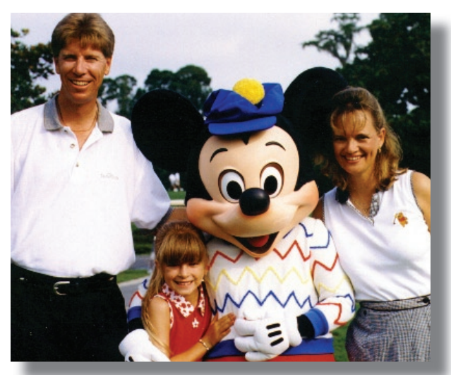
Participants enjoy taking pictures with Mickey Mouse at the Parent-Child Championship.